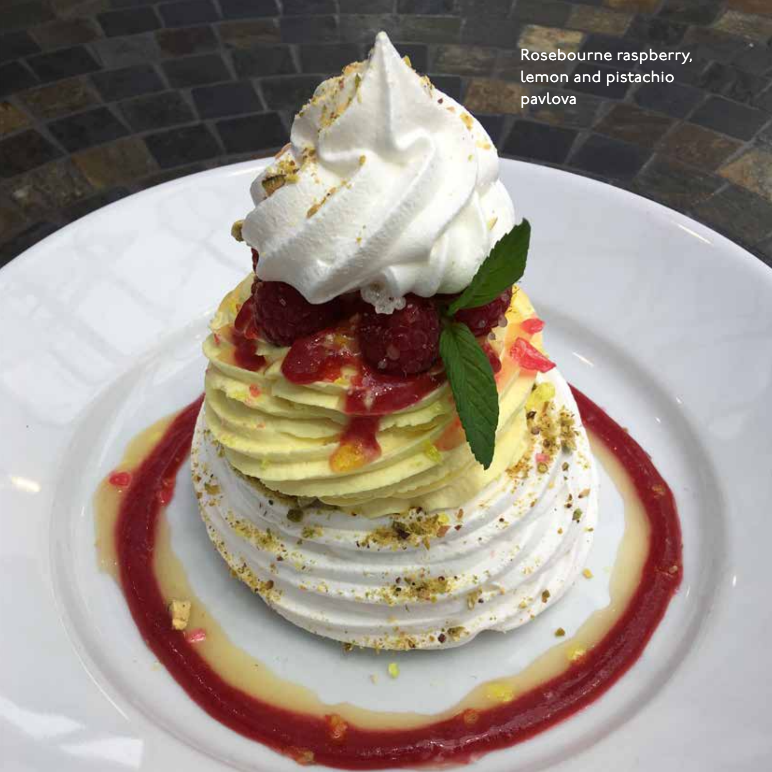
Rosebourne raspberry, lemon and pistachio pavlova